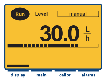
Yellow - shows the control unit is connecting to a smart device