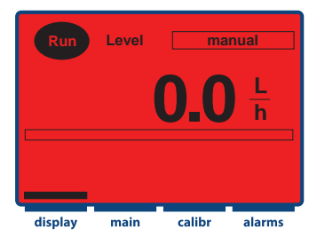
Red - shows alarm mode

Offers not only multiple language options, but also changes colour according to operating function